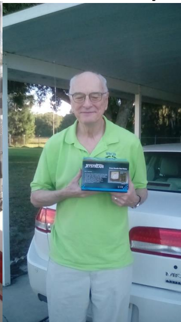
W9CIB Dennis Cross Needle Wattmeter