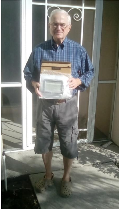
K0LJW Lloyd Atomic Clock