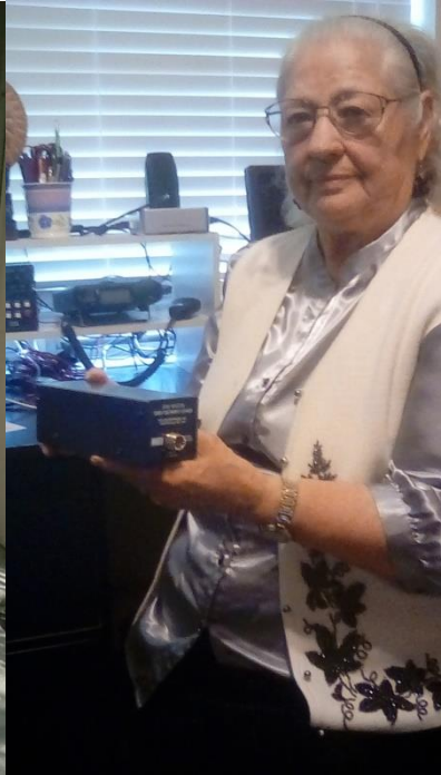
KN4PXJ Cathy 300 Ohm Dummy Load MFJ Clock