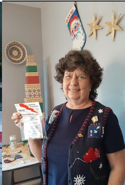
KB4DWR, Barbara Transi-trap Lightning Protection unit